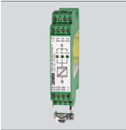
RS-485 interface repeater DI-1PSM